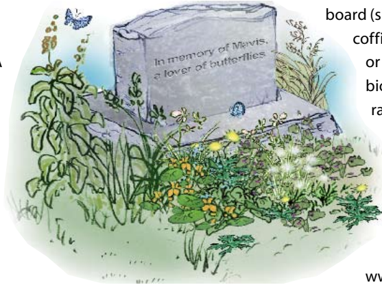
ILLUSTRATION: MARY-ANNE COTTER

directly onto the earth. Apparently it is a gentle and smooth operation. A bonus for those contemplating their post-death contribution to the planet is that natural decomposition can start at once! Also, there are not the energy costs associated with cremations.